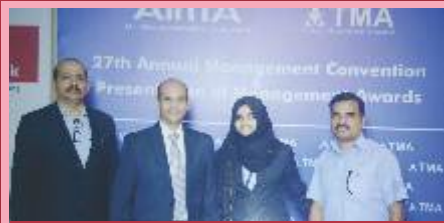
Best Student Award & Scholarship by TMA