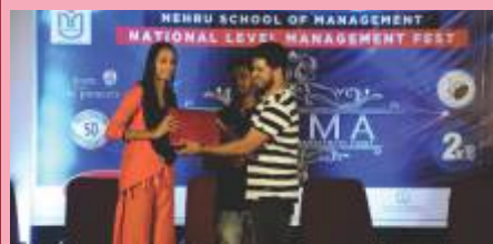
KARMA '18 Lucky Coupon Winner