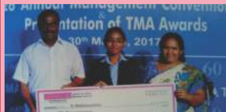
Best Student Award & Scholarship by TMA